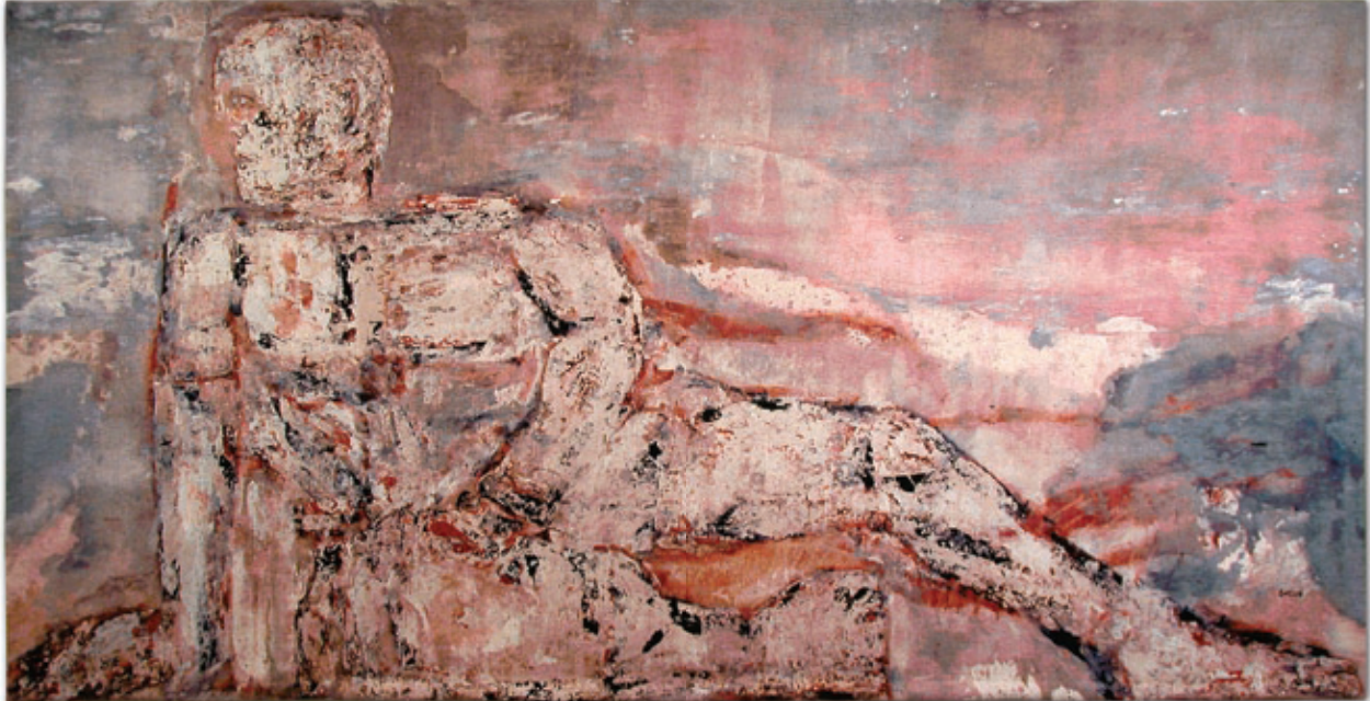
Leon Golub , Reclining Youth, 2003 , the tapestry, 82 x 168 inches Derived from Mr. Golub's 1959 lacquer on canvas painting, Reclining Youth : Collection of the Museum of Contemporary Art in Chicago, a gift of Susan and Lewis Manilow.